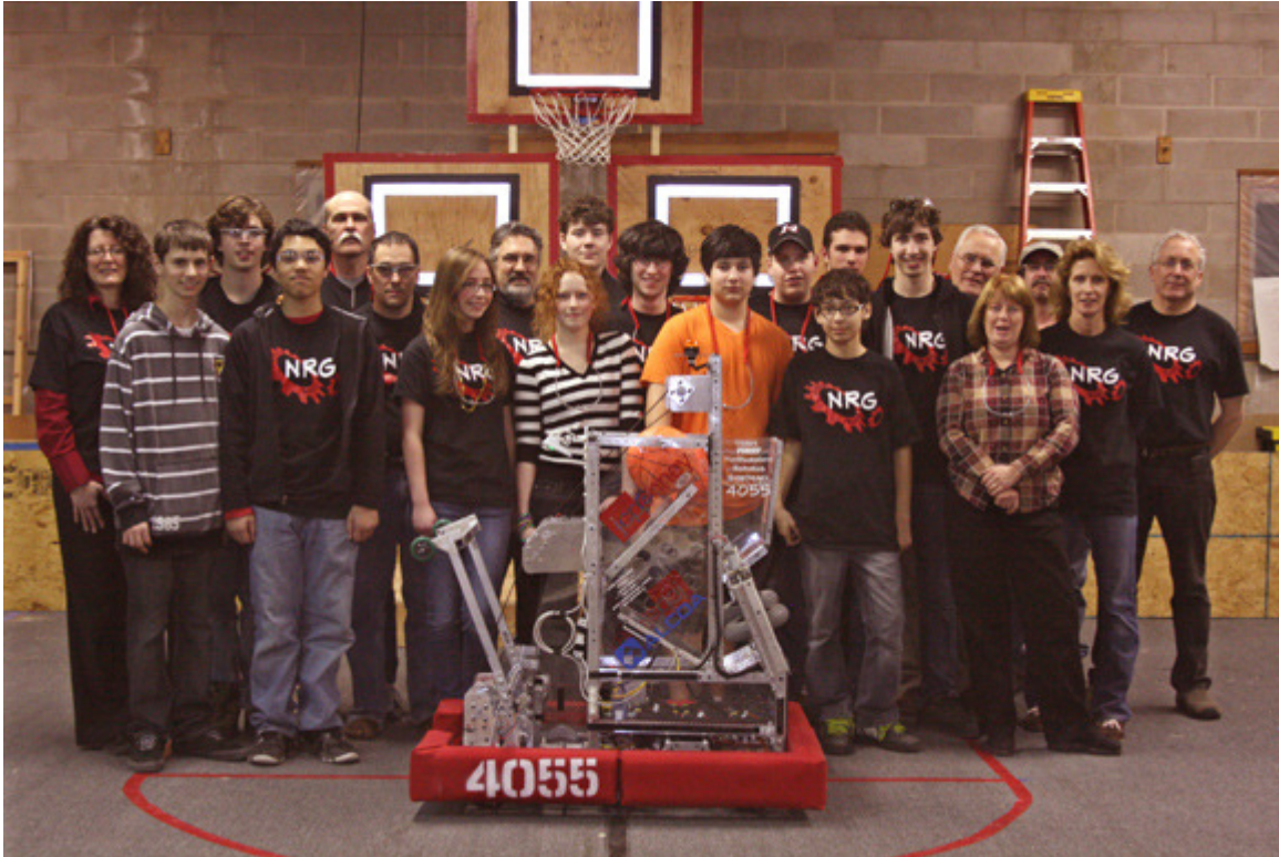
The NRG 4055 Gearheads team with the completed robot.

The NWR7 team, known as the NRG 4055 Gearheads, sponsored by Alcoa-Howmet and JCPenney, hopes to win an invitation to the FIRST championship to be held in St. Louis at the end of April. More info about the team is available at www.nrg4055.org .