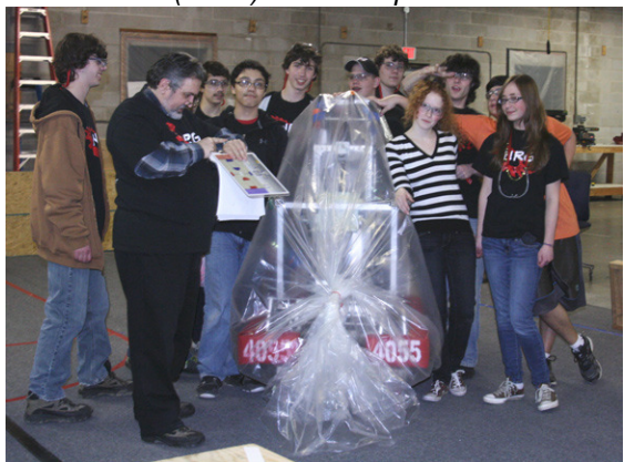
The bagged and tagged robot.