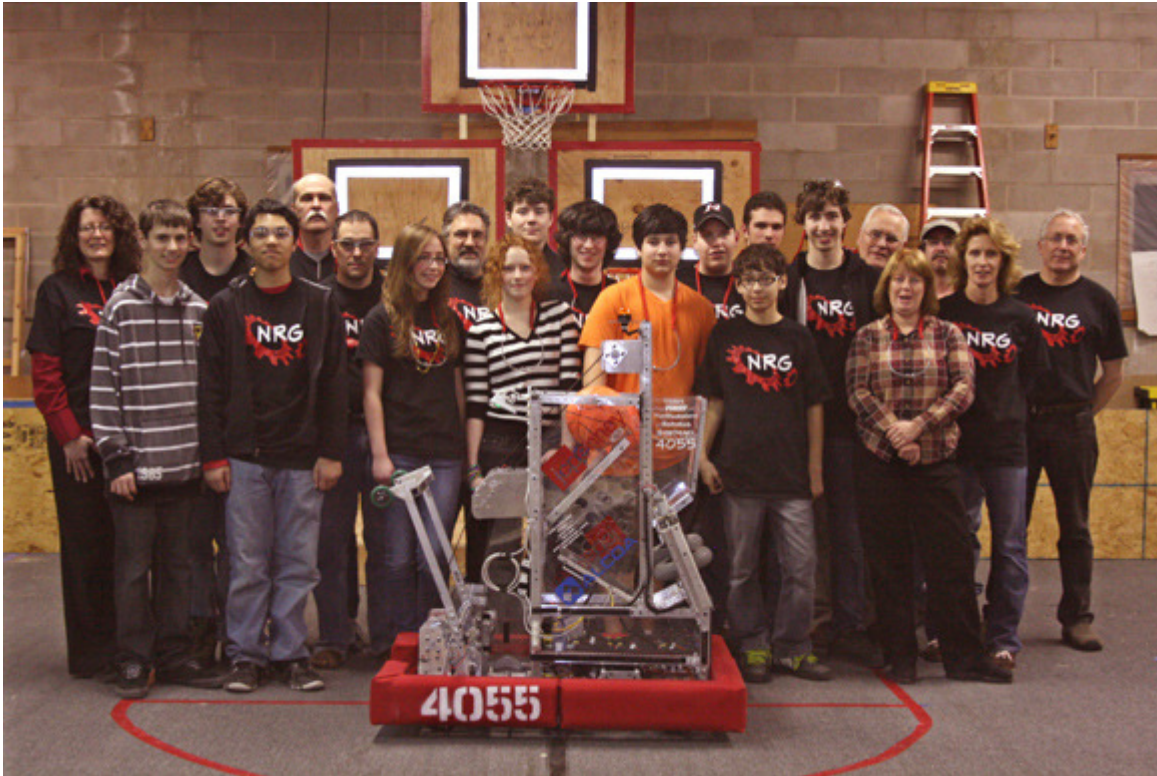
The NRG 4055 Gearheads team with the completed robot.